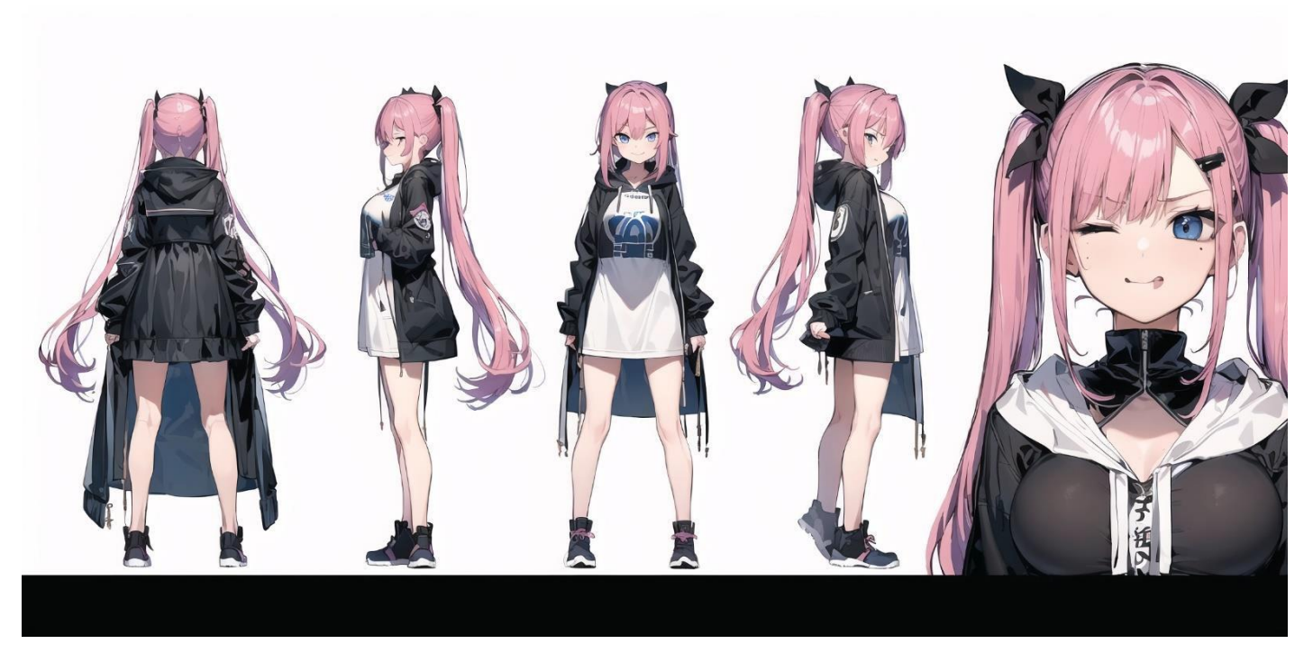
Confirm that you can create an image based on it.