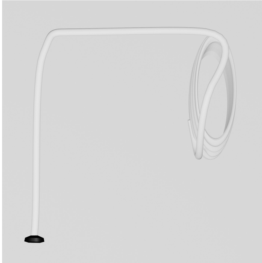
Figure 3: Artist's rendition of signature tool, the grapple rope. Will also use it in combat via "hojojutsu".

8-BALL appears to intentionally initiate a pregnancy to coincide with a campaign to destroy an organization. The Department interviewed male individuals who claimed to have had intercourse with 8-BALL. While exact circumstances differed, a common report was that 8-BALL would approach an outside apartment window while the interviewees were at home, and request non-verbally to be let inside. 8-BALL would then, still non-verbally, proposition them for sex. Multiple of those interviewed most recently remarked that they knew what it meant when 8-BALL came to visit them unannounced, and those who were