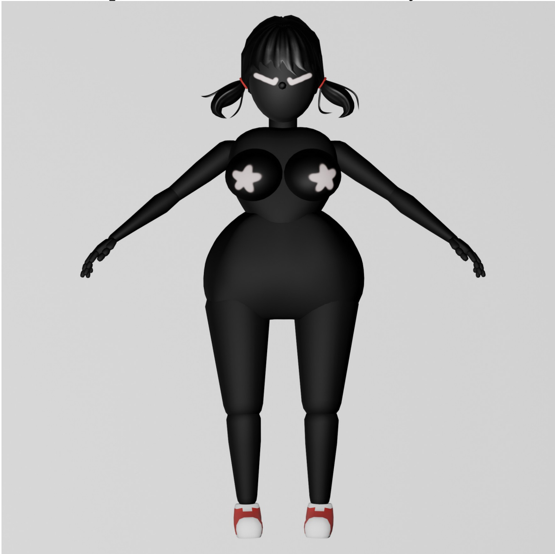
Figure 1: Artist rendition, subject pictured here not pregnant. Metahuman type at this stage: Class 1.

Varies (see Superhuman abilities summary)