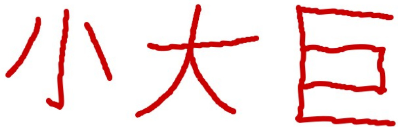
Figure 4: Kanji seen spray painted on the abdomen of 8-BALL. From left to right: Small, Large, Giant.

The Japanese Kanji symbols seen spray-painted on 8-BALL's abdomen have also sparked speculation at the department. Roughly translated, they describe how late in the pregnancy 8-BALL is (see Figure 4). It's been argued that the use of Kanji, the proficient use of Japanese martial arts, and 8-BALL's short stature might indicate Japanese ancestry.